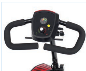
Delta Bars as standard.