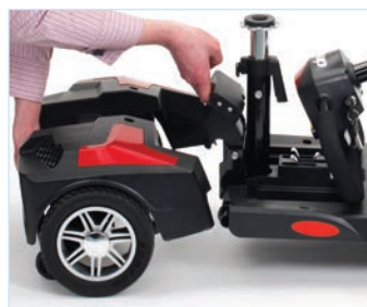
Splits easily in seconds.