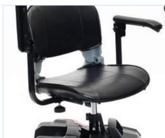
360° swivelling seat.