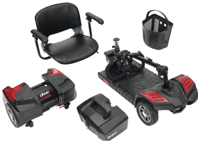
Splits easily for storage and transportation.